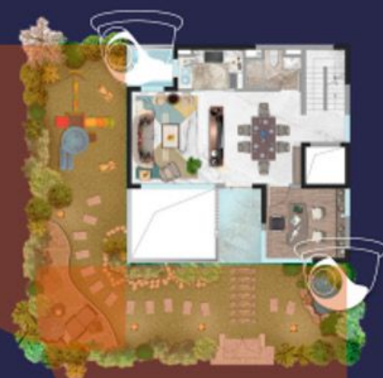
Villas or High-End Residences